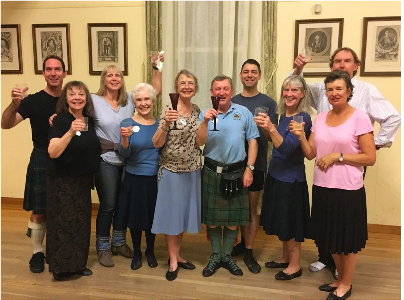
IB members at the Thursday class

The Editor's first wedding anniversary was on 27 th February, so he and Mrs Editor took some cava along to the San Francisco Thursday night class, and people brought cake. It was only when we were enjoying our feast that someone pointed out that the name of the cava was very appropriate for a group of dancers!