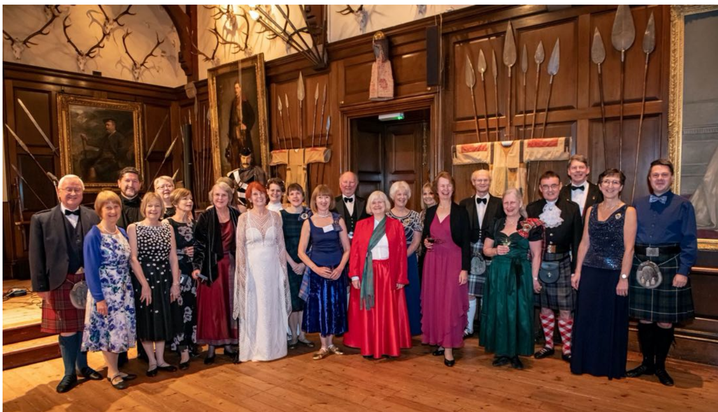
The IB at Winter School

February 2020 saw 130+ participants (including a good number of IB members from around the globe) attending the RSCDS 21 st Winter School in Pitlochry.