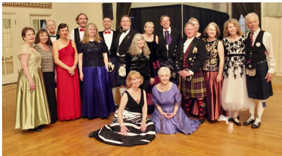
IB members pictured at the Valentine's Ball