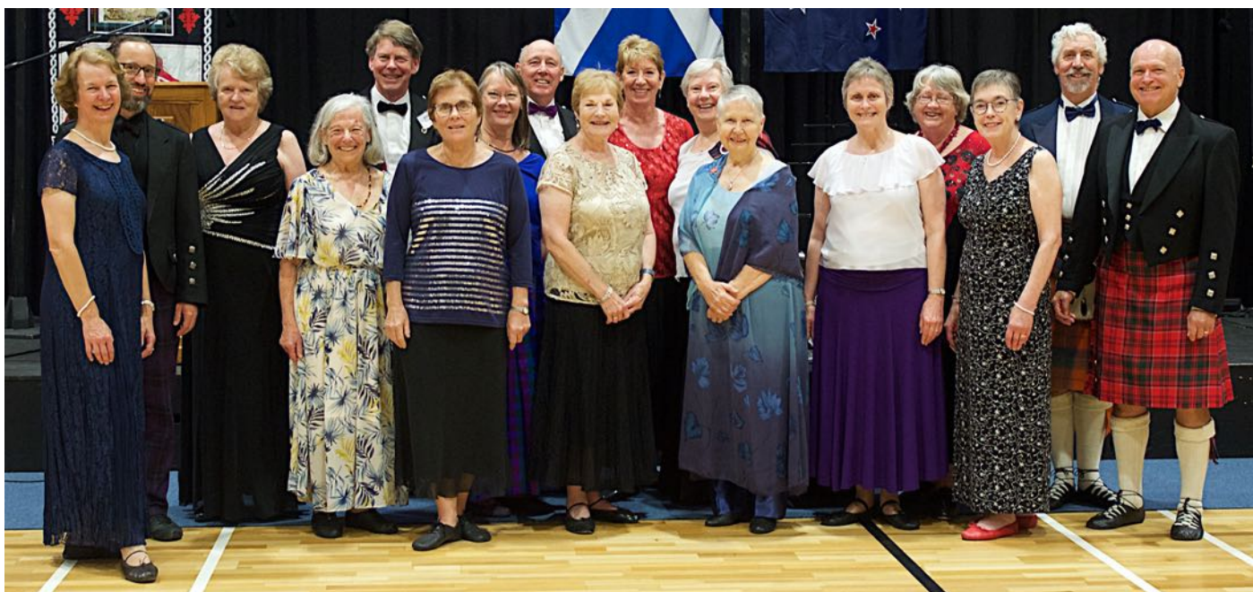
IB members at New Zealand Summer School